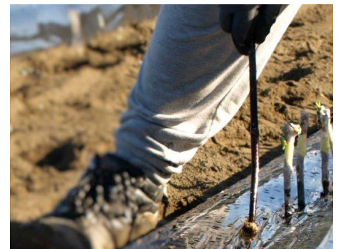
Figure 3. Newly grafted vines being planted in nursery field.