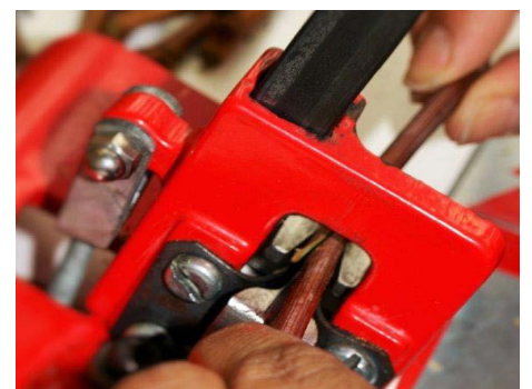
Figure 4. Vine being grafted in V graft machine.