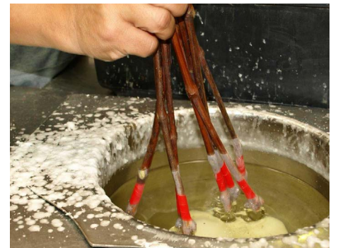
Figure 2. Newly grafted vines being dipped in wax for graft wound protection.