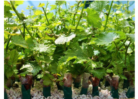
Figure 1. Grafted vines packed in sterile growing media.

Vines meet a series of detailed physical specifications. These are discussed in detail on the following page.